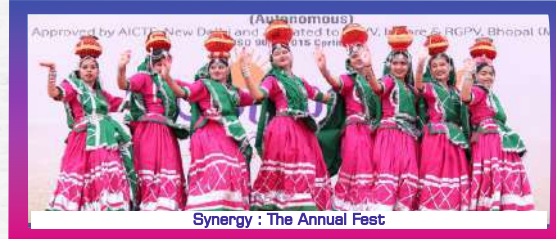
Synergy : The Annual Fest