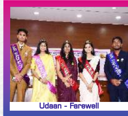
Udaan - Farewell