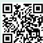
Virtual Tour Girls Hostel