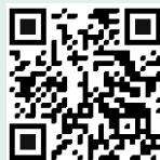
Virtual Tour Boys Hostel

Hostel Facility Available for Boys & Girls