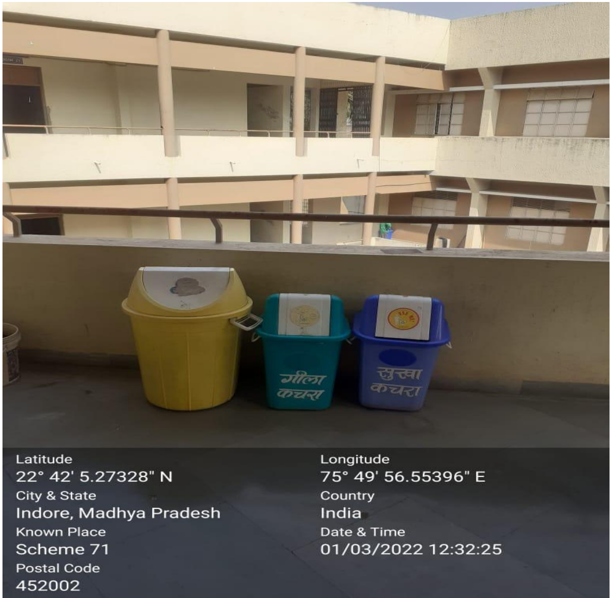
Segregation of wastes

Describe the facilities in the Institution for the management of the following types of degradable and non-degradable waste